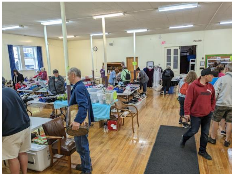
LOTS OF STUFF FINDS NEW HOMES