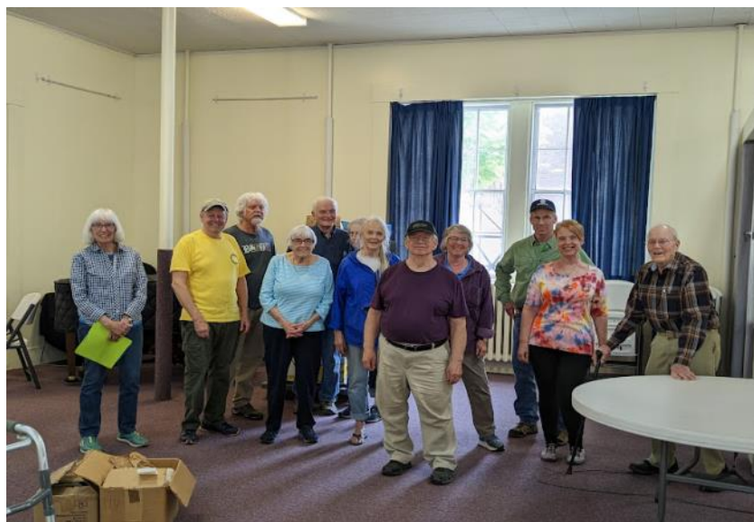
TEAMWORK MAKES LIGHT WORK